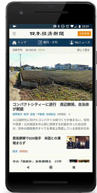
Nikkei Progressive Web App on mobile device.

For technical details about Nikkei's implementation, visit https://developers.google.com/web/showcase/2018/nikkei .